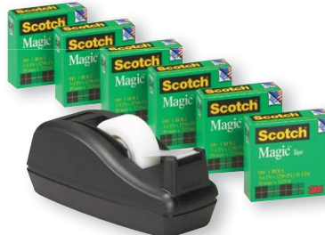
MMM 810C40BK 6 rolls of Scotch® Magic™ Tape with C40 Dispenser