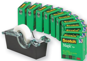
MMM 810P10K-DS 10 rolls of Scotch® Magic™ Tape with FREE DS520 Dispenser

*The SUBWAY® Card is an electronic spending/gift card. Available balances may be used for purchases at participating SUBWAY® Restaurant locations in the US and Canada – a list is at www.MySubwayCard.com . The SUBWAY® Card never expires and no fees are charged. Actual card received may differ in appearance from card shown.