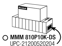
MMM 810P10K-DS UPC-21200520204

Scotch® Tapes SUBWAY® Offer, P.O. Box 3100, Grand Rapids, MN 55745-3100