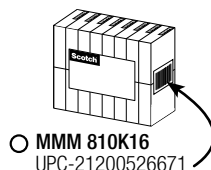
MMM 810K16 UPC-21200526671