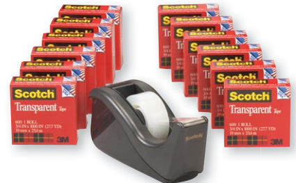
MMM 600K-C60 12 rolls of Scotch® Transparent Tape with C60 Dispenser