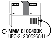
MMM 810C40BK UPC-21200596841