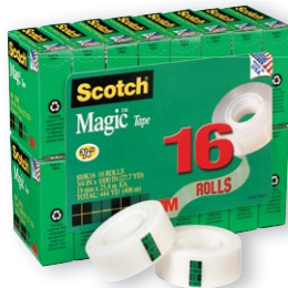
MMM 810K16 16 rolls of Scotch® Magic™ Tape