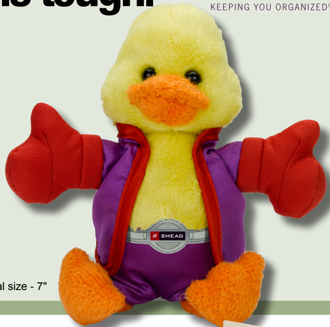
Actual size - 7"

FREE Tuff Duck when you purchase 2 boxes of Smead Tuff filing products. July 1 – December 31, 2008