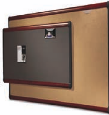
Tan and Gray Sueded Fabric Mahogany Finish Frame