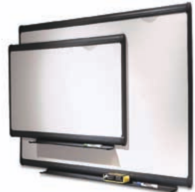
Premium Porcelain Magnetic Graphite Finish Frame