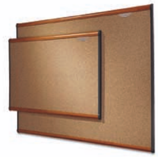
Colored Cork Light Cherry Finish Frame