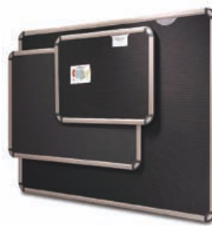
Black Embossed Foam Euro Aluminum/Titanium Finish Frame