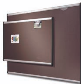
Gray Diamond Mesh Fabric Aluminum Finish Frame